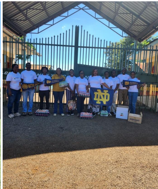
Members of the University of Notre Dame Club of East Africa with the Justice Nest Team